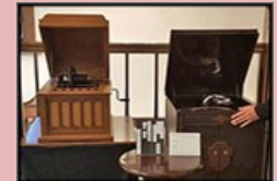
Gramophone Sound (Held on an irregular base)