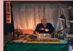
Demonstration (Closed irregularly)